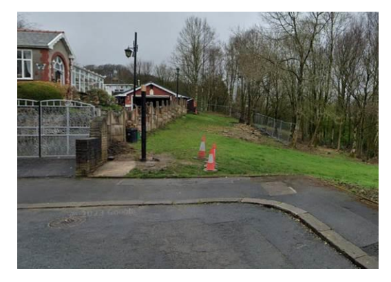
Google earth view of the application site (March 2023)