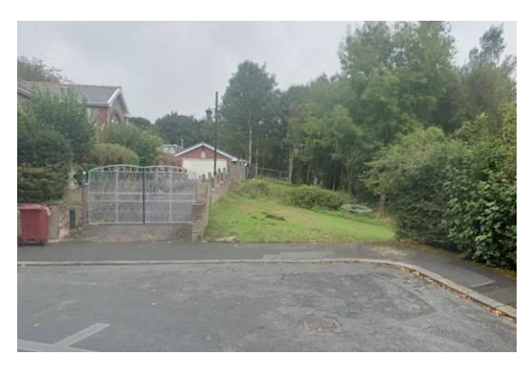
Google earth view of the application site (September 2021)